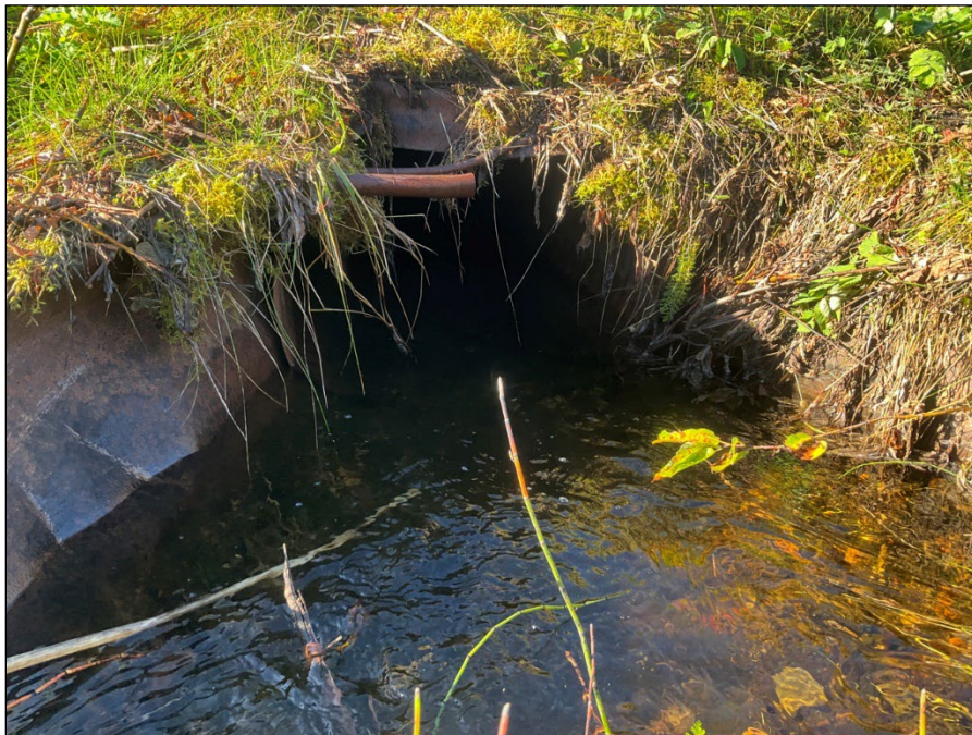
Figure 3.—Culvert upstream of the road.