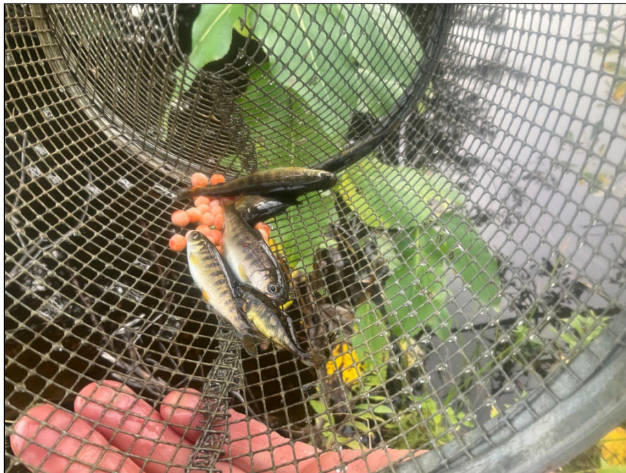
Figure 1.–Juvenile coho salmon captured at waypoint 1220.