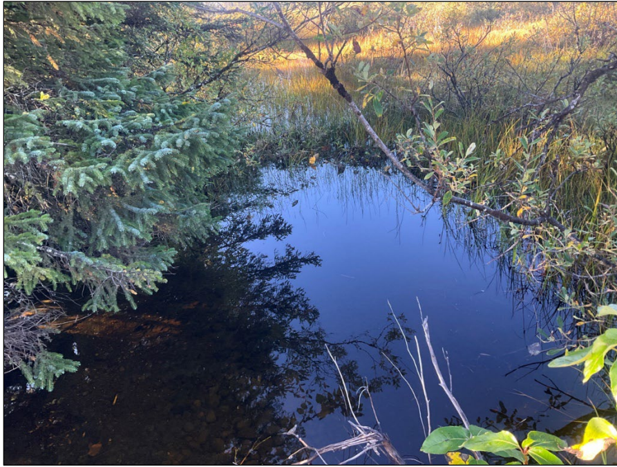
Figure 2.—Water ponded downstream of the culvert.